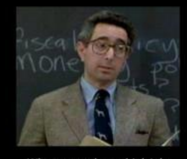
What my students think I do