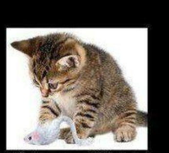
What my owner thinks I do