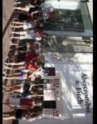
What society thinks I do.